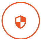
Image DRM Controls. With Vitrium Security, you are in complete control. Choose from a variety of image control and digital rights management settings including print and copy control, custom watermarks, browser limits, expiry dates, and more. Additionally, with Vitrium’s content security software, you can:

Share Images in Secure Client Portal. Vitrium Security’s Secure Client Portal can be set up within minutes, and lets you share all images with designated audience members and contacts. Organize and catalog images with Vitrium’s Content Tag Management functionality, making it easy for your audience to search and preview images associated with their accounts. All permission settings for users and images, including dynamic watermarks, are automatically applied to the Secure Client Portal. With just a click of the mouse and a few items to set up, you can deploy your branded portal.